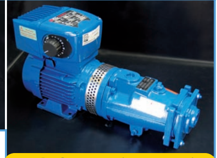
...and after our intervention