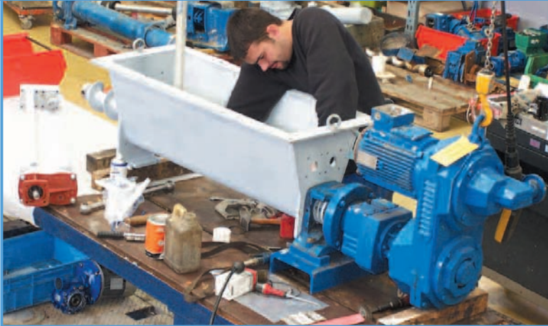
Revamping of a Moineau pump GBB series with installation of the new bridge-breaker device